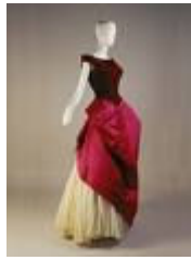
Charles James gown